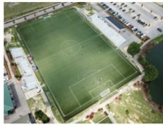
Championship Field – 3,200 seats