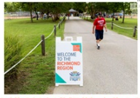
Ironbridge Park, Senior Softball World Championships, Aug 7-9

Richmond area's hotel occupancy and tax collections down significantly, but tourism 'bright spot' this summer is sporting events